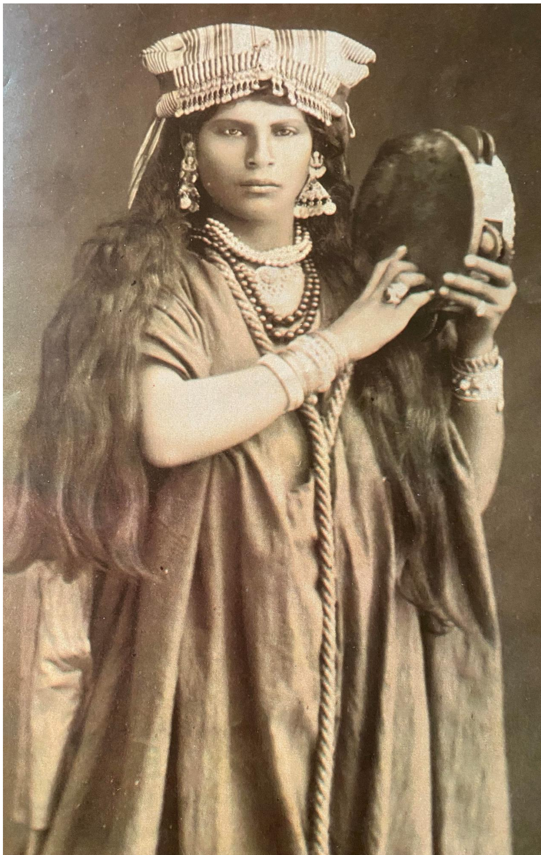
Syrian musician 1890