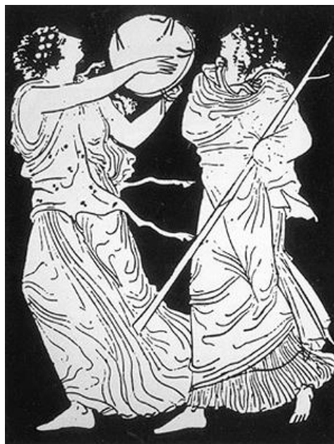
Maenads, Greek Fifth Century BCE

[In ancient Greece, Maenads were followers of the wine god Dionysus. They prepared his wine, and used it (along with dancing and sex) to access a state of frenzied, divine madness and ecstasy. In this altered state, they were believed to be possessed by the god, imbued with gifts of prophecy and superhuman strength.]