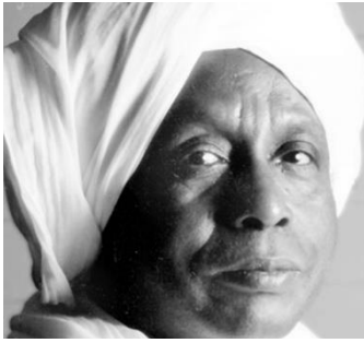
Hamza El Din