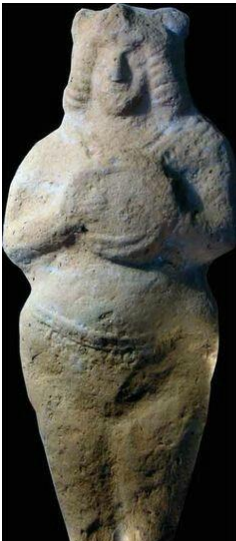
Mesopotamian terra-cotta female figure with drum, approx. 1550 BCE.