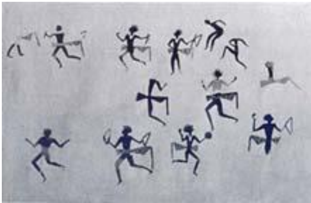
Detail: Çatal Hüyük

On the wall of a shrine room in Çatal Hüyük is a band of human figures, clad in leopard skins and playing various percussion instruments .... Among this group is a figure holding a horn-shaped instrument in one hand and a circular frame drum in the other. They are two of the oldest known instruments in history... Many scholars have suggested that this scene depicts a shamanic ritual. ( When the Drummers Were Women . Layne Redmond. 1997. P. 47)